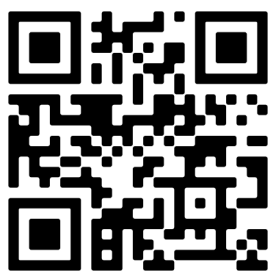
Blue Ropes Signup Genius