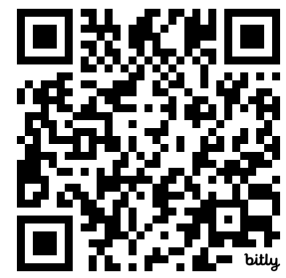
Youth Permission Form