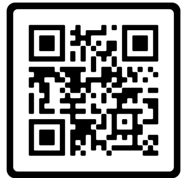
Blessing Bags sign up genius

The high school youth and Chiapas Mission Team are putting together blessing bags for members of our community experiencing homelessness. Youth and adults are invited to review the Blessing Bags SignUpGenius and sign up to bring items on March 3. Following the service project, the Chiapas Mission Team will continue to meet until 7:30 p.m.