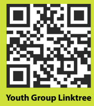
Youth Group Linktree