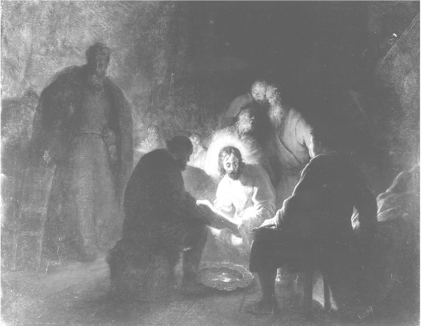
Christ Washing the Disciples' Feet by Jan Lievens